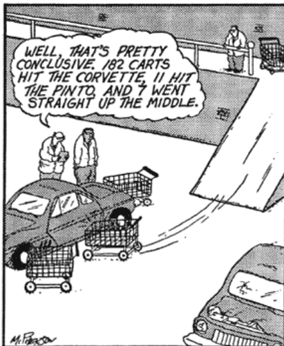
Researchers at MIT prove that rolling shopping carts will almost invariably hit the most expensive car in their vicinity.

**Any material on this syllabus is subject to change if a compelling situation arises. You will be notified via email and Bb announcement.**