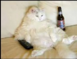
What the professor thinks I do