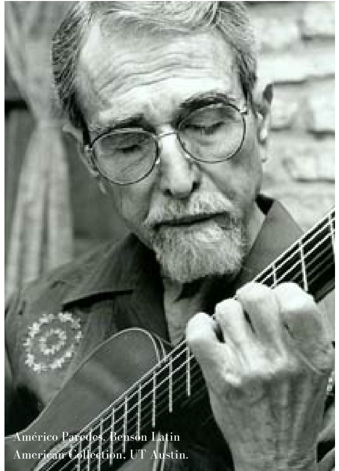
Américo Paredes, Benson Latin American Collection, UT Austin.